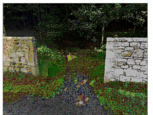
Pedestrian pathway continues between site and nearby farm. Picture above shows existing wall opening, adjacent nearby farm, with pathway continuing to farm.